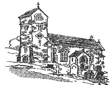
All Saints Wootton Courtenay