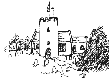
St Nicholas Withycombe