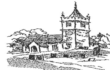
St Petrock Timberscombe