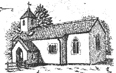
St Bartholomew Rodhuish