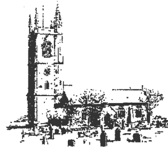
St John the Baptist Carhampton