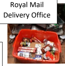
Royal Mail Delivery Office