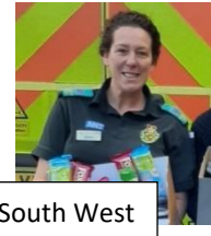
South West Ambulance