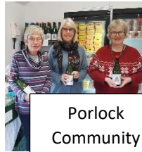
Porlock Community Orchard