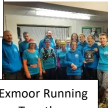
Exmoor Running Together